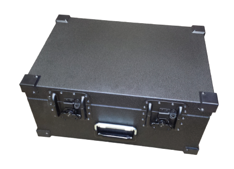
Hard Case (IATA Carry-on Compliant)