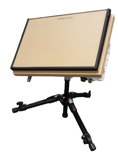
Antenna with Tripod